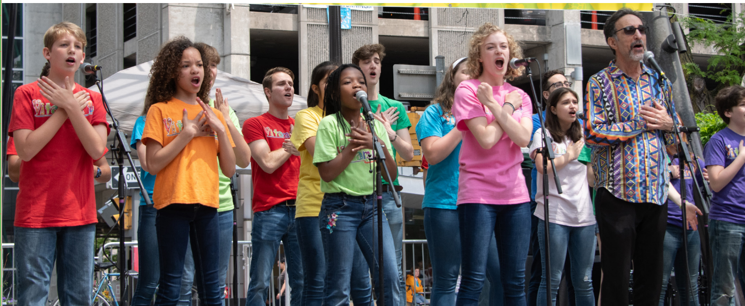
Ithaca Festival 2019

The Vitamin L Project is a Project of The Center for Transformative Action